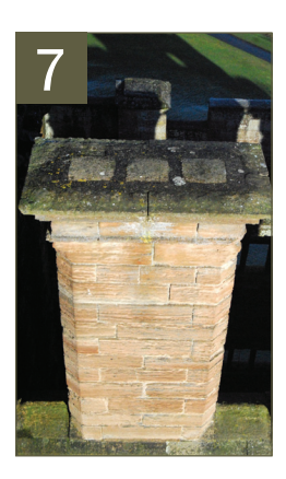
Hou mony lums are there in the north range?