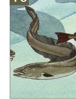
Hou mony prongs are on the eel leister in the museum?