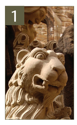
Whit is the lion on the foontain haudin?

Mind and ask a steward if ye're needin ony help.