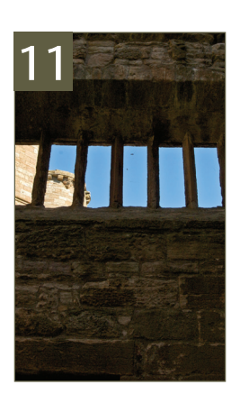
Hou mony wee windaes mak up the muckle ladder windae in the king's presence chaumer?