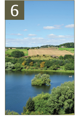
Hou mony islands can ye see in the loch?