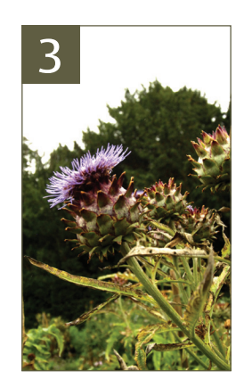
Name twa o the flouers cairved abinn the windaes in the north range.