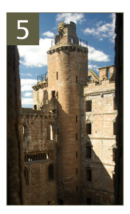
Hou mony steps dae ye hae tae sclim frae the fit o the queen's turnpike tae Queen Margaret's Bower at the tap?