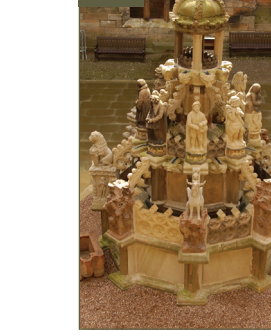
Hou mony horns and antlers can ye see on the foontain?