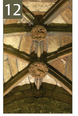
Whit is cairved ahint the unicorns on the ceilin at the windae end o the king's bedchaumer?