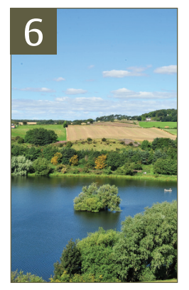
How many islands can you see in the loch?