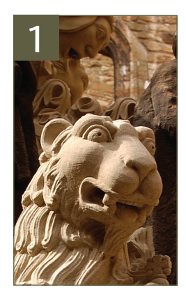
What is the lion on the fountain holding?

Remember to ask a steward if you need any help.