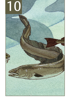
How many prongs are on the eel spear in the palace museum?