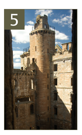
How many steps do you have to climb from the bottom of the queen's turnpike to Queen Margaret's Bower?