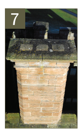
How many chimneys are there in the north range?