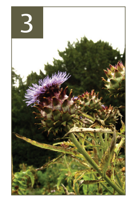
Name two of the flowers carved above the windows in the north range.