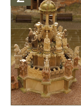
How many horns and antlers can you count on the fountain?