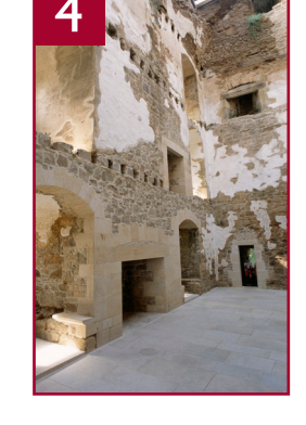
hae fin it wis biggit?