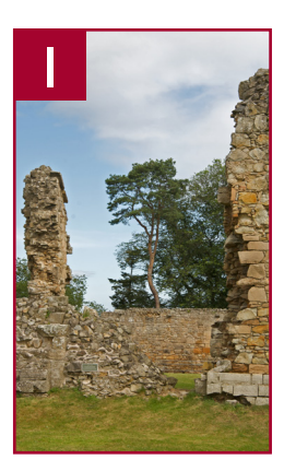
Fars the auld main gate tae the palace?