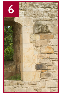
A mannie's face is carvit by the windae in the Great Ha. Can ve draw it ablow?