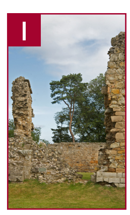
Which gate was the original main entrance to the palace?

Explore the buildings and woods around the palace with this fun, fact-finding mission. Remember to ask a steward if you need any help.