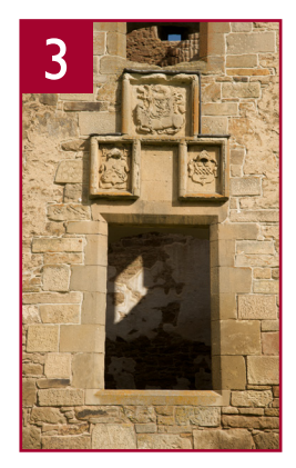
Look at the carvings over the tower entrance. What is on the unicorn's back?

How many murder holes are there over the east gate?