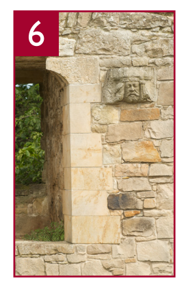
Can you draw the man's face carved into the wall of the great hall?