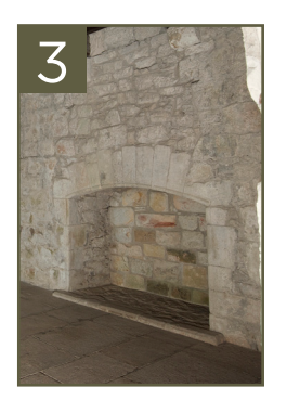
How many fireplaces can you count in the tower?

How many steps are there in the spiral staircase in the tower?