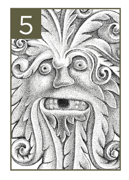
How many faces can you find on the ceiling at the top of the tower?

How many toilets (sometimes called latrines) can you find around the castle?