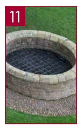
People living in the castle needed fresh water. How deep was their well?