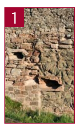
The outer gate was the castle's first line of defence. How many gun holes can you count in it?

Remember to ask a steward if you need any help.