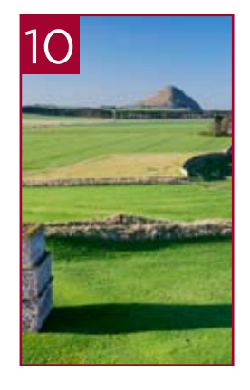
You can see a hill from the top of the castle. What is it called?