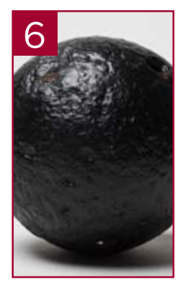
Cannons were used to defend the castle. How many cannon balls can you see in the gatehouse?