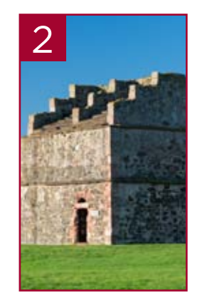
Pigeons were kept in the doocot. What did the castle's residents use them for?