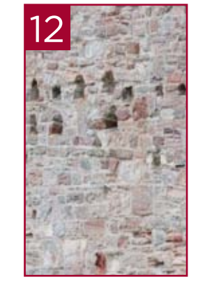
Look for lots of small holes in the castle walls. What were they used for?

Need a clue? Look in these places: 1. Outer gate; 2. Doocot; 3. Doocot; 4. Above entrance; 5. In the Mid Tower; 6. In the Mid Tower; 7. Kitchen; 8. Next to the kitchen; 9. Prisons; 10. Look on the information panel, Monck makes his move; 11. Well; 12. On wall near the well 10. Look on the information panel, Monck makes his move; 11. Well; 12. On wall near the well